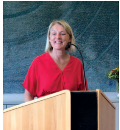
Evelyn Regner ( Vice-President of the European Parliament )