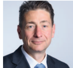
N. Forgó

Requirements: Regular attendance and active participation in class discussions (40%) and an open-book essay exam (60%).