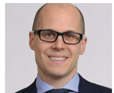
C. Koller