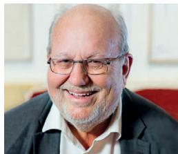
K. Vocelka

Requirements: Attendance and participation in class discussion constitute 30%, a short paper 30% and a written final (essay-type) 40% of the grade.