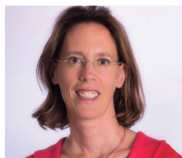
C. Kwapil (© Oesterreichische Nationalbank)