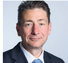
N. Forgó

Requirements: Regular attendance and active participation in class discussions (40%) and an open-book essay exam (60%).