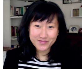
Bo-Mi Choi (© Bo-Mi Choi)

Requirements: Reading all course materials (30%), active and regular attendance (30%), final exam (40%)