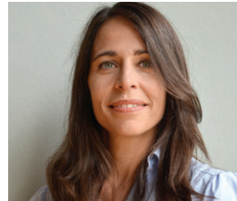
S. Kritzinger (©SHS)

Requirements: Performance will be assessed on the basis of attendance and participation in class discussions (20%), a role play taking different party positions and government negotiations into account (40%), and a written final exam (40%).